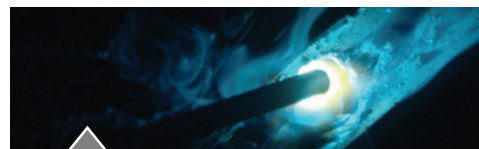
View with Jackson Safety® ADF Helmet with Balder® Technology